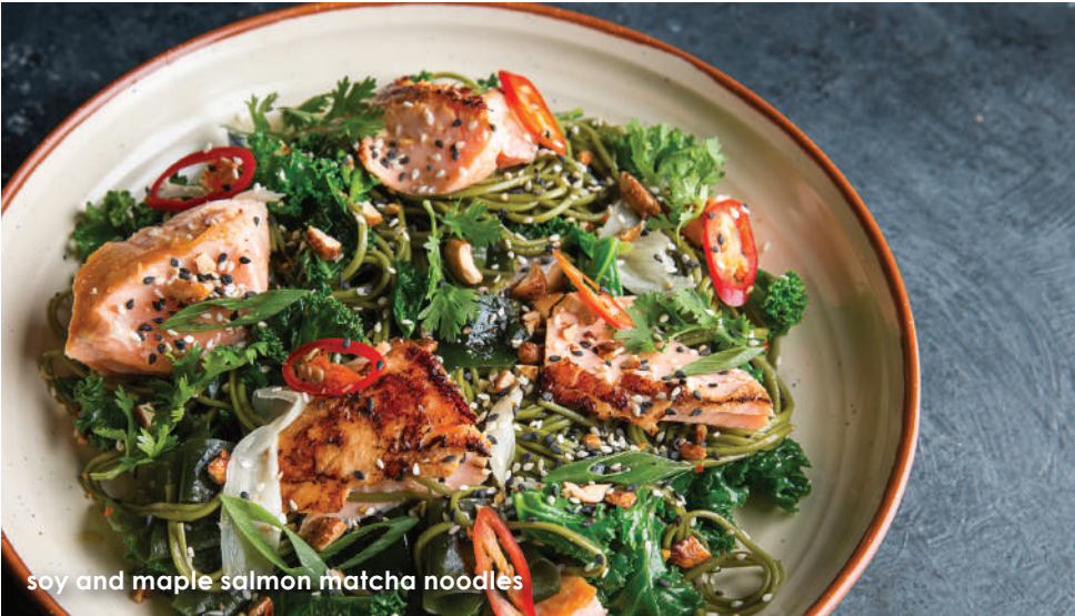
soy and maple salmon matcha noodles