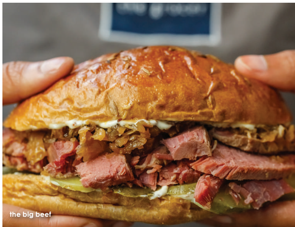
the big beef

All prices are in AED, inclusive of 7% municipality fee, 10% service charge and 5% VAT.