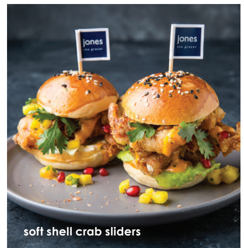
soft shell crab sliders