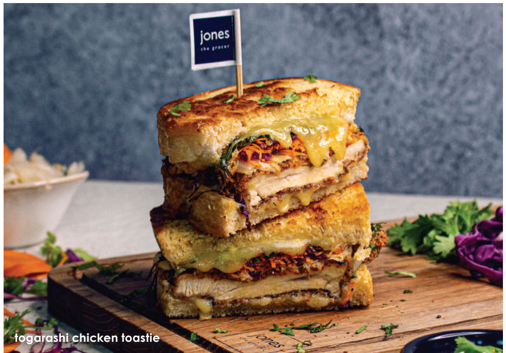
togarashi chicken toastie