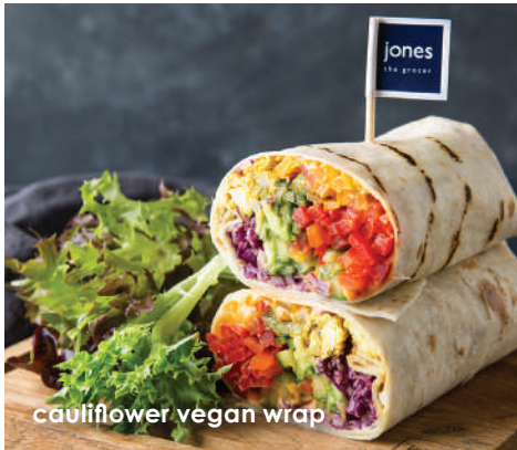
cauliflower vegan wrap