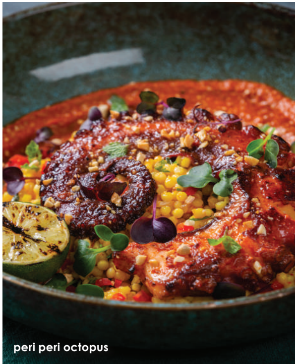
peri peri octopus