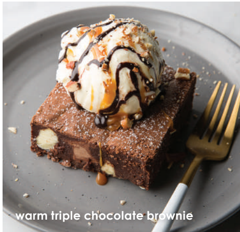
warm triple chocolate brownie