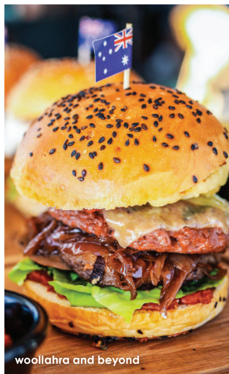
woollahra and beyond