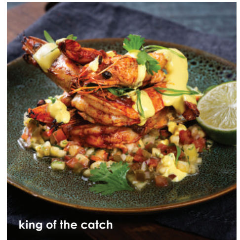
king of the catch