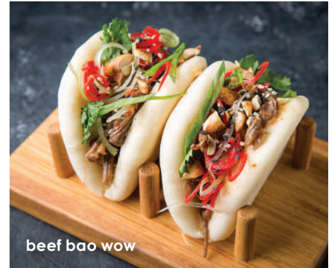
beef bao wow