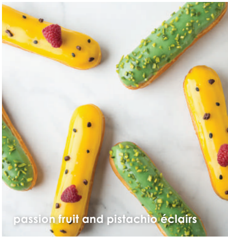
passion fruit and pistachio éclairs